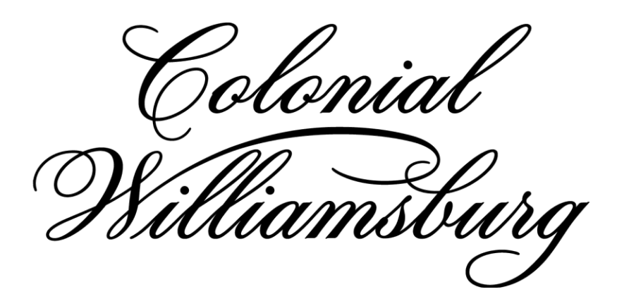
Department of Education Outreach Department of School and Youth Group Tours